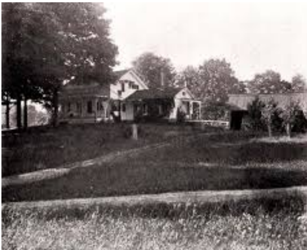
Henry Homestead at Geauga Lake, Geauga County, Ohio